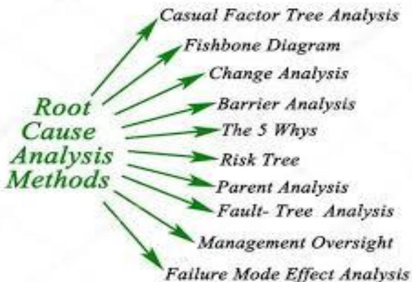
Figure (1) Root Cause Analysis (RCA)