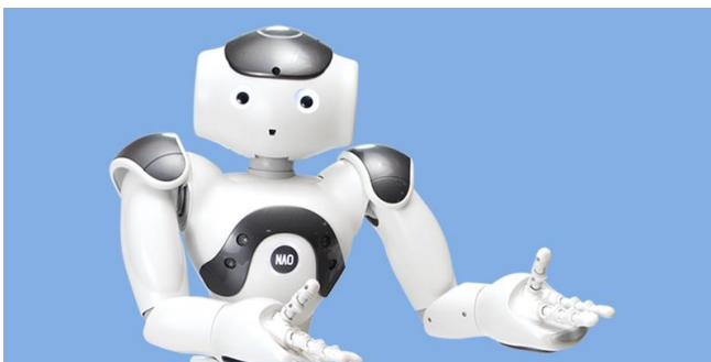
Fig.1: A model of the Humanoid Robot

In the rapidly developing field of robotics, mobile robots have become increasingly popular in a variety of contexts and are used for a range of tasks that primarily require human involvement and collaboration [4-6].