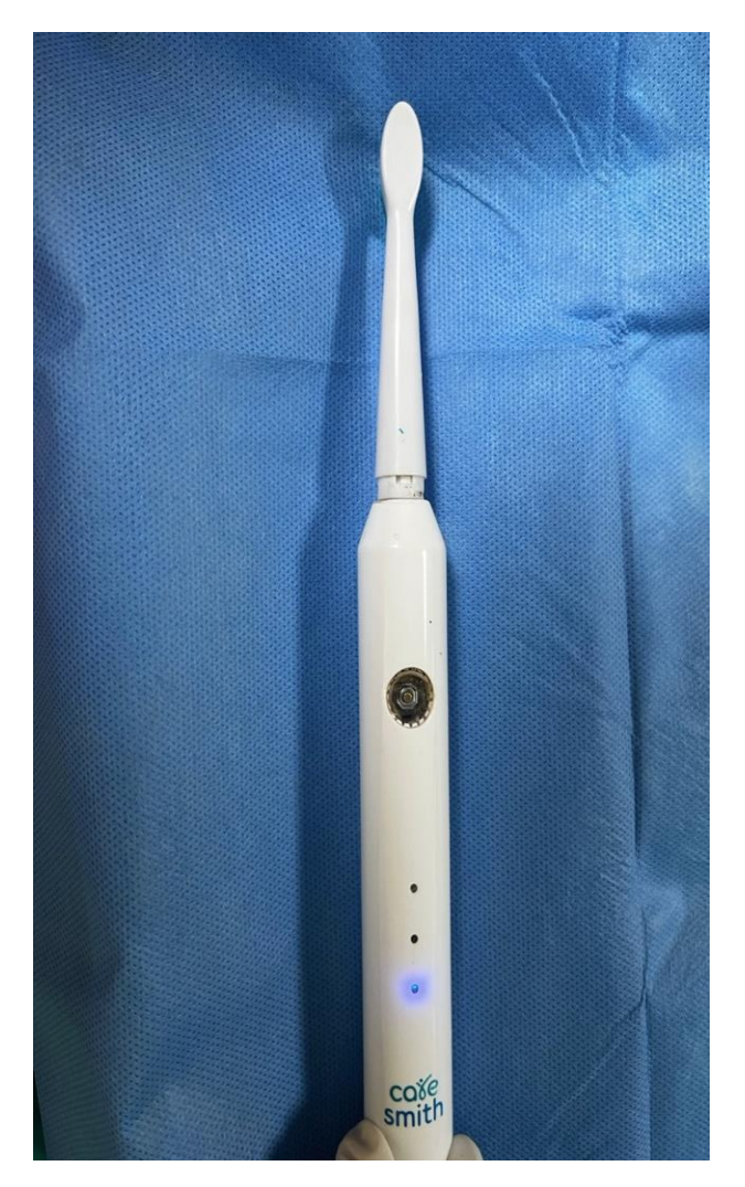
Figure 1: Motorized toothbrush used for debridement

techniques to the individual clinical scenario and available equipment. We report an innovative and novel technique of using a motorized toothbrush in aiding surgical wound debridement.