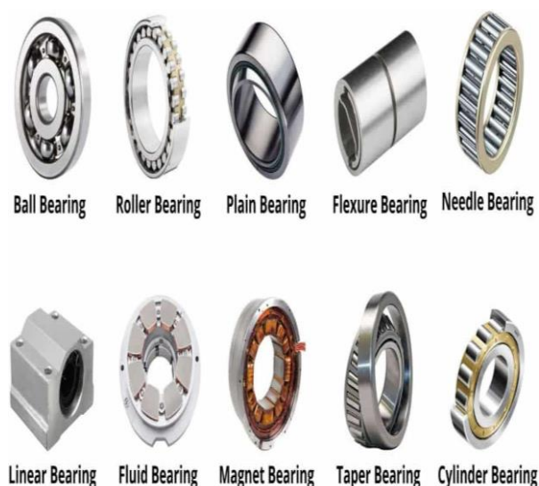
Figure 2: Types of Bearings