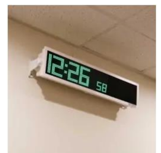
Figure 2: Modern Wireless LED Message Board: For Text Messaging and Digital Time Display